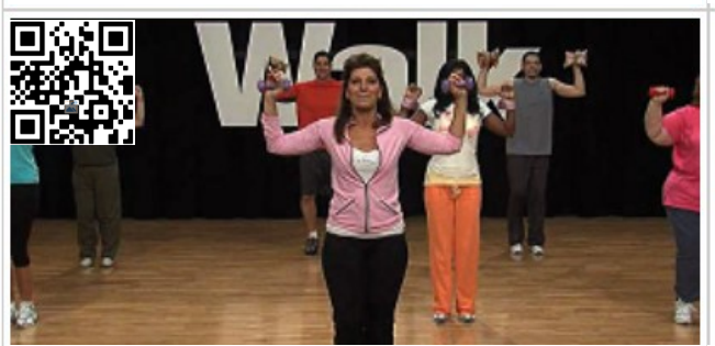
Walk Indoors! Add Weights