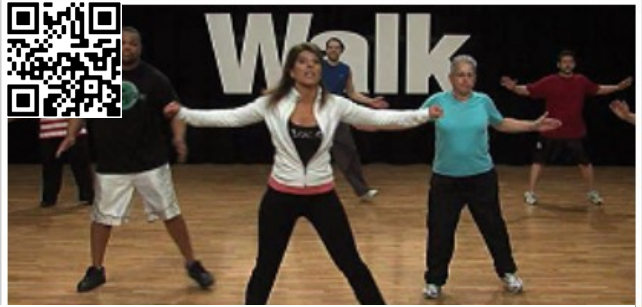
Walk Indoors! Add Upper Body Moves