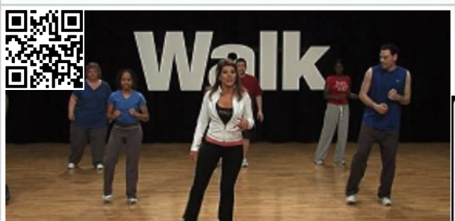
Walk Indoors! Add Intensity