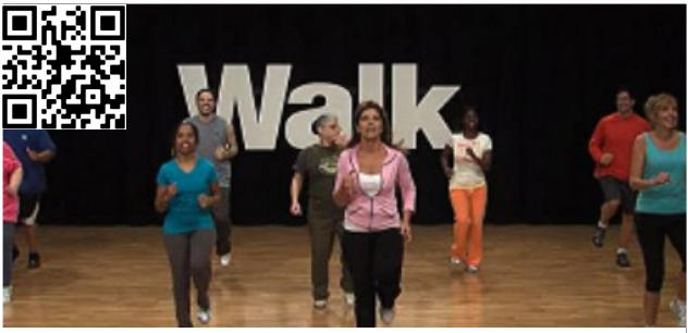
Walk Indoors! Interval Training